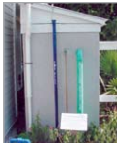
These cisterns at the Florida House Learning Center each hold 2,500 gallons of rainwater.