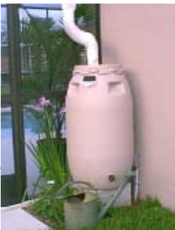
This barrel was painted to match the house color.

Now the barrel can be painted any way you like — by stencil, a pattern, freehand, etc. Allow the paint to dry completely before applying one to two coats of polyurethane. Allow the polyurethane to dry between coats.