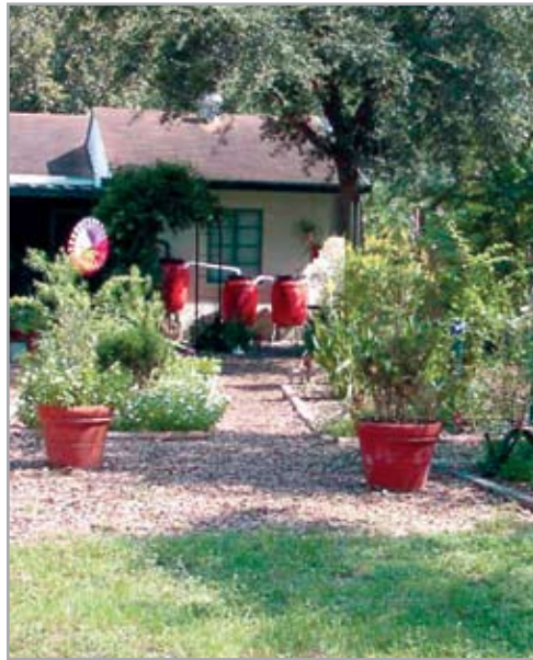
Rain barrels are one component of this water-efficient landscape.

Although a small rain barrel may not provide all the water needed to sustain your plant material, it can certainly supplement your current watering schedule. Planter beds, vegetable or flower gardens and potted plants can easily be irrigated with the water from a rain barrel.