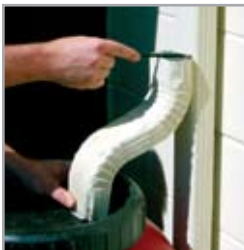
Mark downspout for cutting

To make the transition from the gutter/downspout to your opening in the rain barrel, you can fabricate a crosspiece out of downspout material or purchase a flexible downspout extender. The flexible downspout extender eliminates the need for exact measurement because it bends and stretches to the length you need. Make sure the downspout extender fits the size of your downspout.