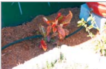
Attach a soaker hose to water nearby plants.