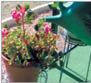
Hand water plants.

If using a soaker hose, take out the pressure-reducing washer to allow more water to flow through the hose ( bottom right ). Filling a watering can to water plants around the yard is always an option. You can also use the water to keep your compost bin moist or to rinse off gardening tools.