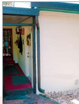
A good spot for a rain barrel.