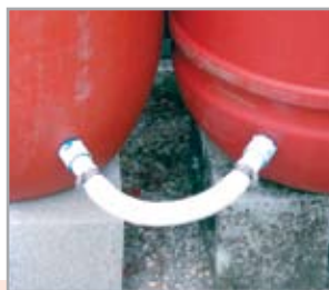
Connecting rain barrels together will allow for more water collection.