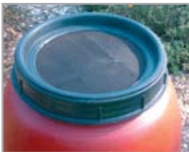
A barrel covered with window screen can be placed under a roof valley to collect rainwater runoff.

Elevating the rain barrel on a platform, such as cinder blocks, will give additional water pressure and will provide clearance for connecting a hose or filling a watering can.