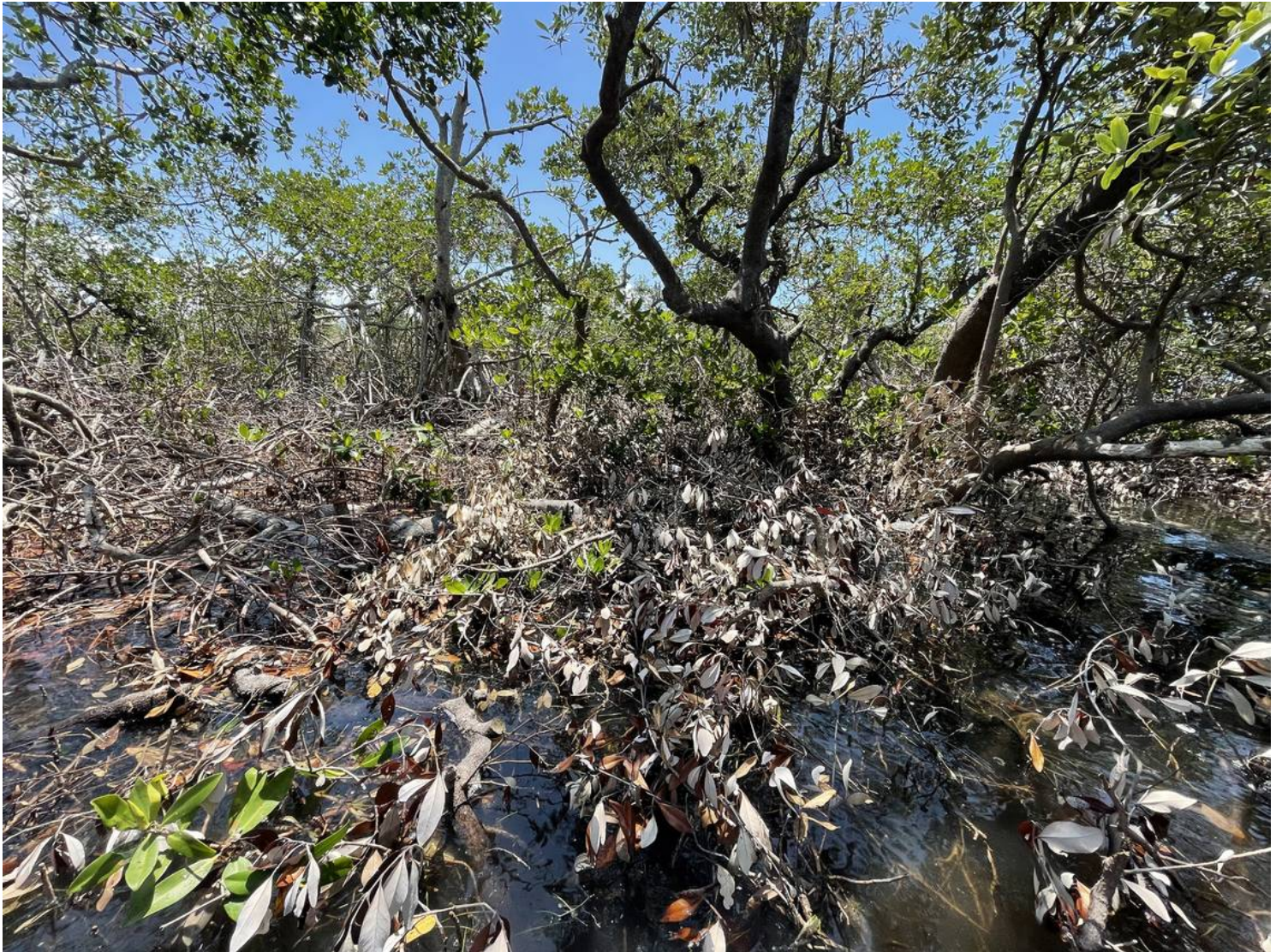
Local environmental advocates have raised concern with recent mangrove trimming along the western shoreline of Sarasota Bay, where the Aqua by the Bay development is under construction. Suncoast Waterkeeper