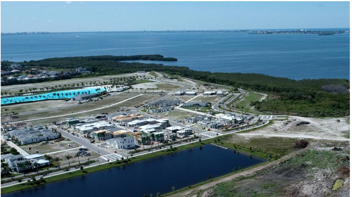
Local environmentalists have raised concerns over recent mangrove trimming along Sarasota Bay where Aqua by the Bay and Cirrus Apartments at Aqua are under construction on El Conquistador Blvd.