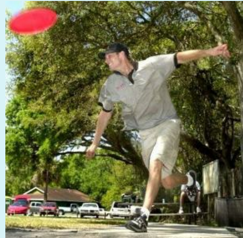
North Water Tower Park is home to the region's oldest disc golf course.

The SBEP Bay Guardians will donate approximately 1,800 hours of community support during a series of volunteer projects. Their primary focus will be the removal of invasive species including Brazilian Pepper trees and Air Potato vines and seeds. Bay Guardian projects are coordinated by Around the Bend Nature Tours. The award-winning Bay Guardians are the largest and most active volunteer group in the region focused on the welfare of Sarasota Bay.