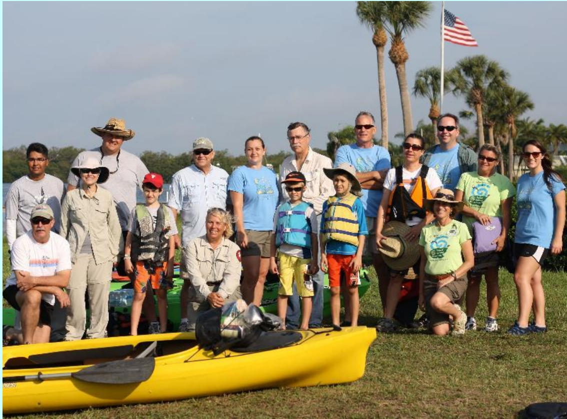
Bowlees Creek Island volunteers

The SBEP Bay Guardians worked with Manatee County Natural Resources and Around the Bend Nature Tour on March 26 to remove invasive plants at Neal Preserve located on Manatee Avenue West in Bradenton. Additional volunteers also worked with Audubon of Florida and Around the Bend Nature Tours on April 16 to remove debris and non-native plants from Bowlees Creek Island Audubon Sanctuary on April 16. More than 33 bags of debris was removed with an estimated weight of 1,000 pounds.