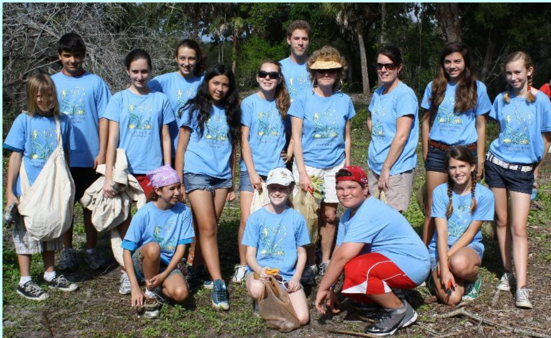
Student volunteers at Neal Preserve