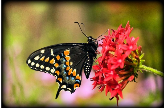
Photo of Eastern Swallowtail

Most of the images and prose focus on the local habitat, coastal scenes, and diverse wildlife associated with Sarasota Bay and other coastal ecosystems.