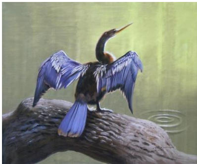
Anhinga by D.L. Rusty Rust See more of Rusty's collection of wildlife paintings and other artists on the Creative Expressions Page at www.sarasotabay.org