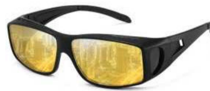
This Headlight Glasses That's Making Nighttime Driving As Daytime Driving