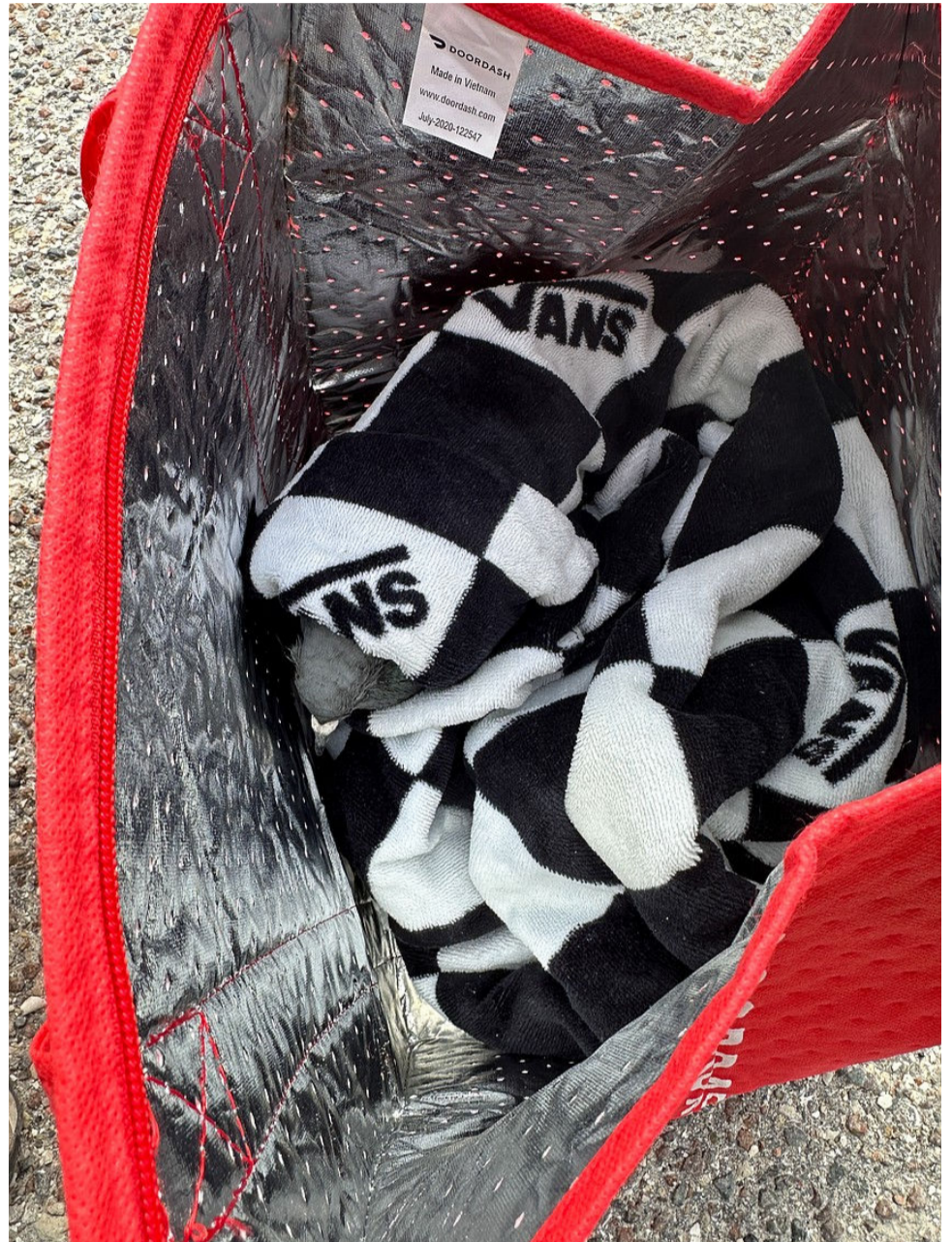
The pigeon was secure in the delivery bag, ready for the short ride to Save Our Seabirds.

For now, the status of the pigeon is unknown, but it's in the capable hands of Save Our Seabird's team.