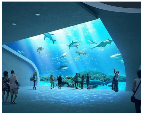
February 22, 2024 Sarasota's landscape of attractions continues to grow — at a price