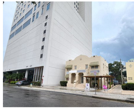
February 22, 2024 Pitch would allow historic buildings to sell air rights, preserve structures