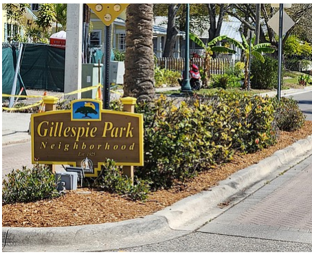
February 22, 2024 Gillespie Park neighborhood feud frustrates city