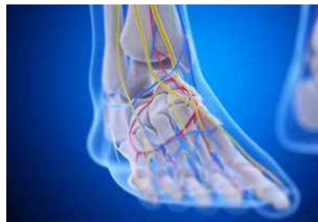
Suffering From Neuropathy? Experience Relief in Just 15 Minutes a Day