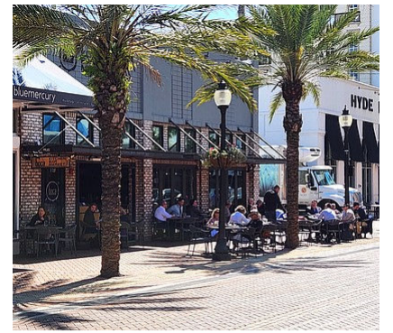
February 22, 2024 New definitions approved for Sarasota restaurants and bars