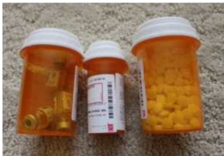
Why Doctors in the Know No Longer Prescribe Blood Pressure Drugs