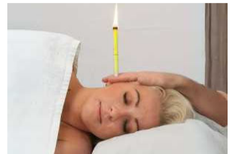
[Watch Now] Odd 10-second Remedy Ends Tinnitus for Good