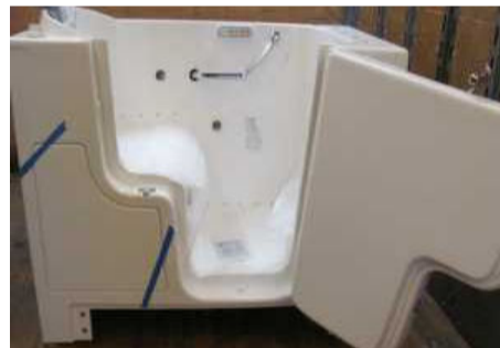
The Cost of a Walk-in Tub if You're over 65