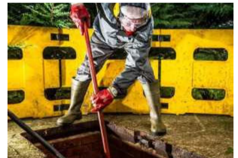
Cleaning Your Drain Might Be Easier Than You Think (See Options)