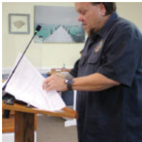
August 22, 2023 Bradenton Beach commission reviews alley issues