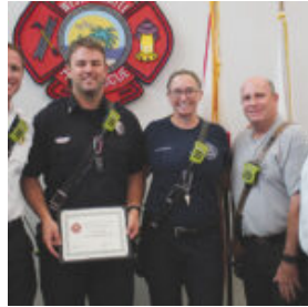
August 22, 2023 WMFR adopts rates, moves forward with 2023-24 budget