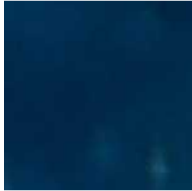
August 22, 2023 Captains report poachers continue to pillage, despite citations