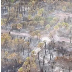
August 22, 2023 Wildfire burns 30 acres at Egmont Key