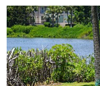
June 28, 2023 Mangrove trimming under dispute with Florida environment agency

Coral reefs are important to Florida's economies through the many benefits they provide such as tourism and creating habitat for important fisheries. The National Oceanic and Atmospheric Administration estimated that