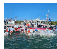
May 18, 2023 Longboat firefighters take the plunge for clean water