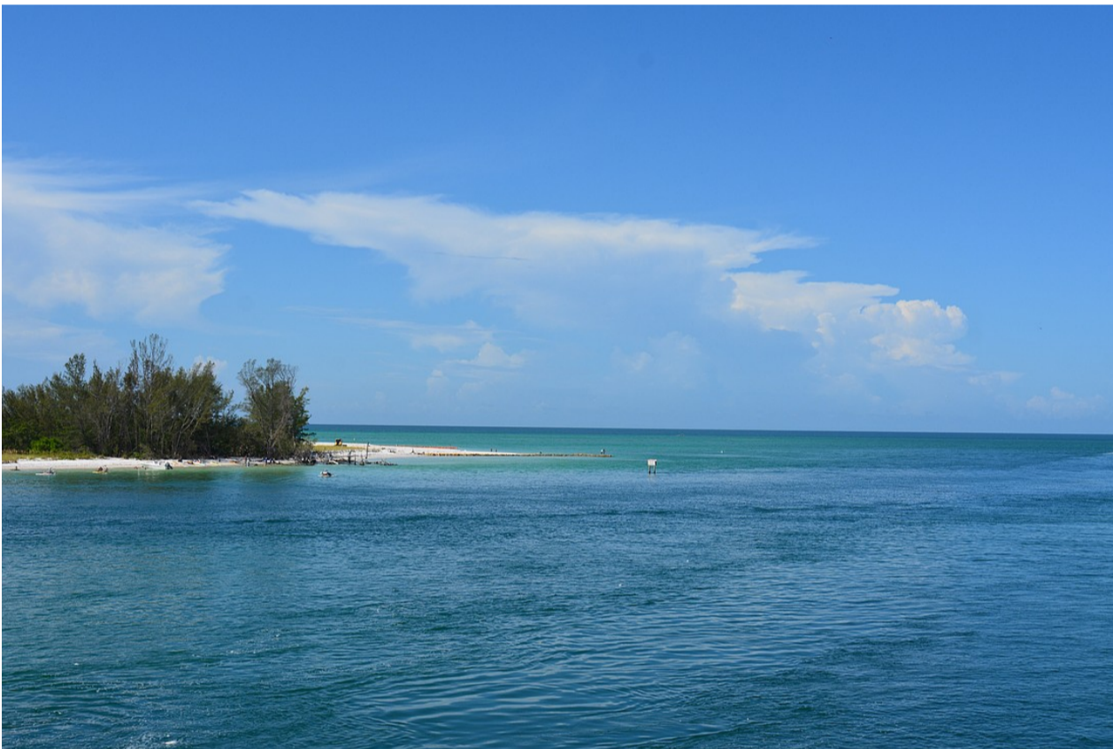
Warmer water temperatures in Florida may have future impacts on Sarasota Bay, according to some local experts.

By Carter Weinhofer | 5:00 a.m. August 2, 2023