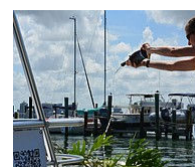
August 1, 2023 Suncoast Waterkeeper christens patrol boat, expands monitoring program