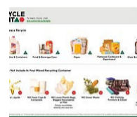
June 9, 2023 Town encourages improved recycling habits with stickers