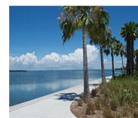
April 5, 2023 Water conservation essential to maintain drinkable supply