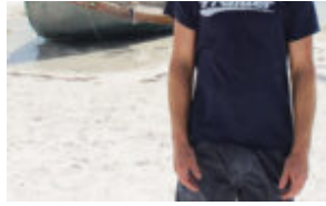
May 16, 2023 Crashed sailboat freed from island shores