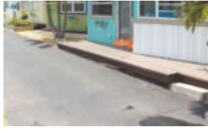
May 16, 2023 Offer to buy Pines Park includes 5-year break for homeowners