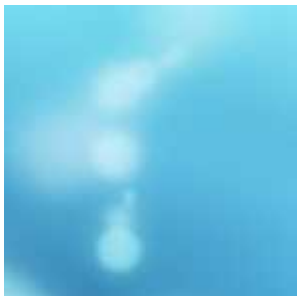
April 12, 2022 HB resident pleads 'no contest' in fatal hit-and-run