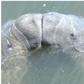
April 12, 2022 Manatees get frisky in Palma Sola Bay