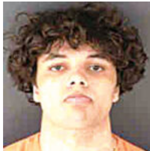
April 12, 2022 Court date looms for 18YO at-large battery suspect