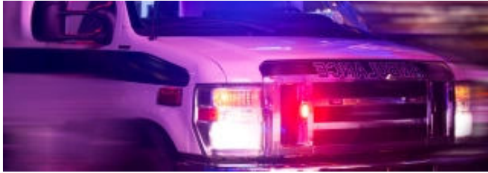
Woman hospitalized after hitting deer, crashing into canal in Manatee County