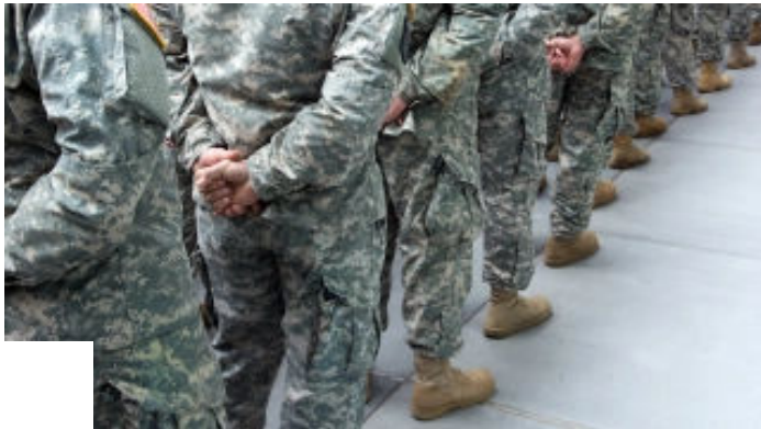
VA accused of 'breaking the law' aimed at cutting wait times, avoiding delayed care