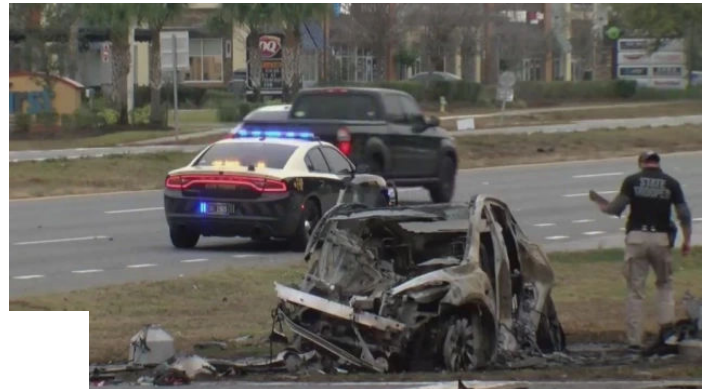
Tesla driver dead after fiery high-speed crash in Lutz, FHP says