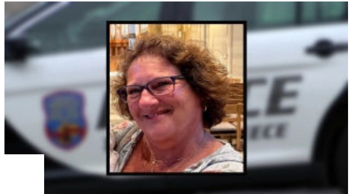
Rochester woman missing on Florida trip found, hospitalized