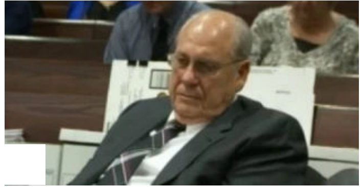
Curtis Reeves trial: Jury selection begins Monday in Pasco theater shooting case