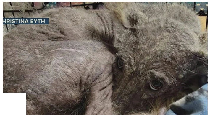
Dog or coyote? DNA results to identify mysterious animal