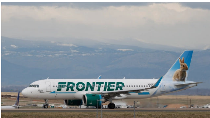
Frontier Airlines buying Spirit in $3B low-cost carrier deal