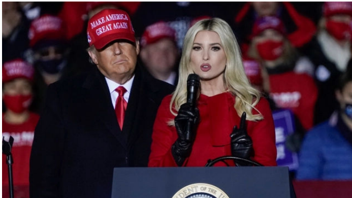
What does Ivanka Trump know about Jan. 6? Congress is asking