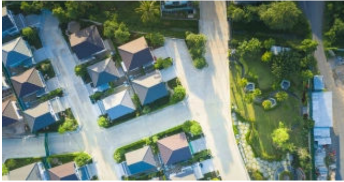
Here's the safest town in Florida, according to new study