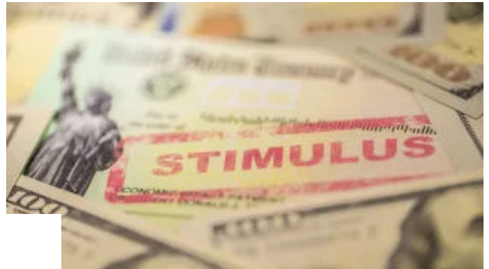
Stimulus checks: Am I getting another $1,400 payment?