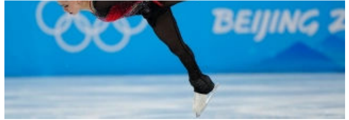
15-year-old figure skater becomes 1st woman to land quad at Winter Olympics