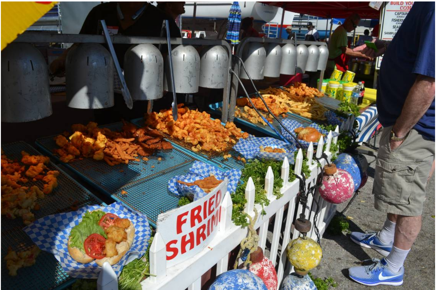
A bounty of crispy fried fish was served at the 2019 Cortez Commercial Fishing Festival.

Other residents of the preserve include crabs and shellfish, including the variety of hard-shell clam commonly farmed in Tampa Bay .