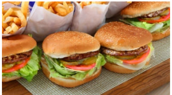
Labor Day food and drink specials: These shops and restaurants are offering deals