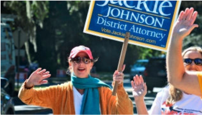
Ex-prosecutor indicted for misconduct in Ahmaud Arbery death