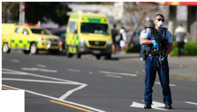
New Zealand police kill 'terrorist' after he stabs 6 people