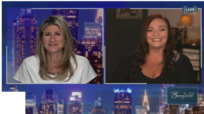
Former officer who appeared on 'Live PD' trades in gun, badge for OnlyFans account