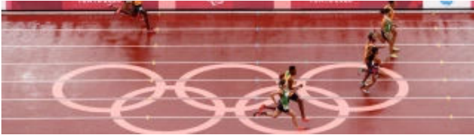
WATCH: Visually impaired Paralympic athlete gets engaged to guide runner after finishing race