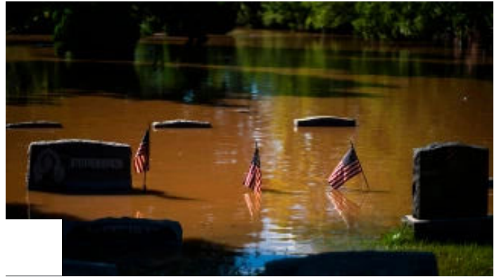
After Ida soaks Northeast US, cleanup and mourning continues