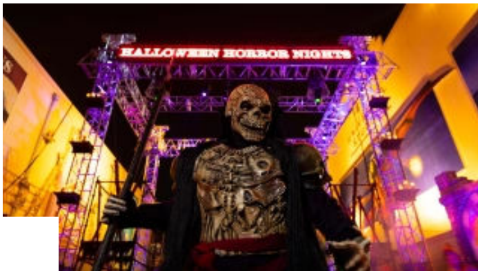
Universal's Halloween Horror Nights open for screams, celebrates 30 years of 'fear'