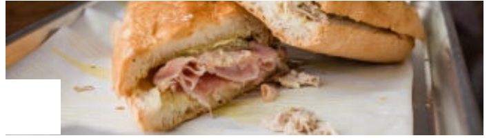
World's biggest Cuban sandwich, adventures to Shell Key & power boats in Tampa Bay this Labor Day weekend