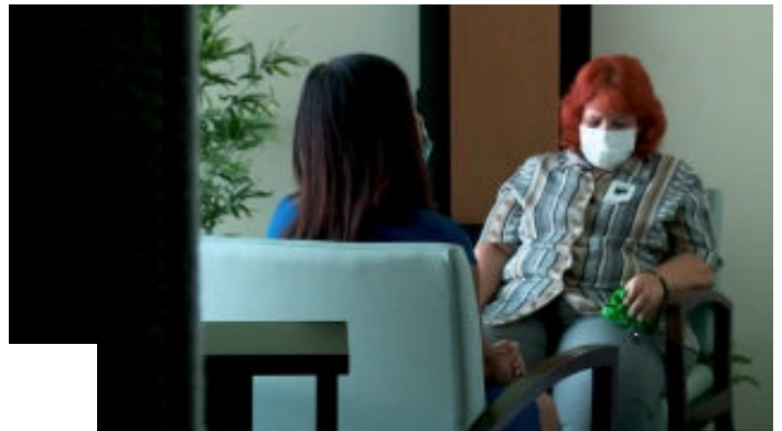
'It just seems so unfair': Mother loses 2 of her children to COVID within a month