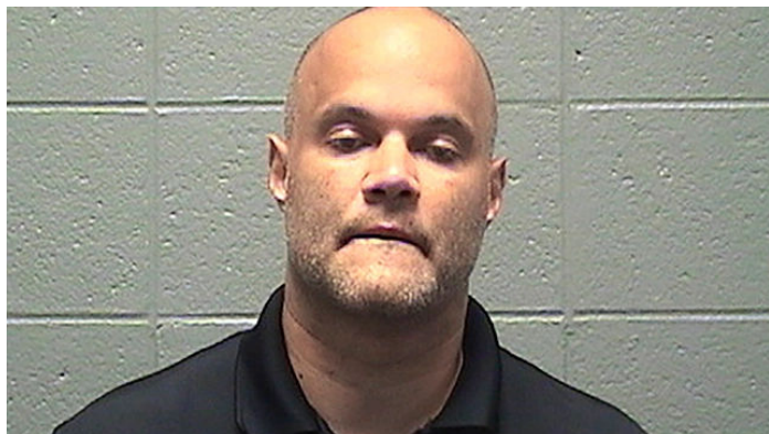
Police lieutenant accused of shoving flashlight between teen suspect's buttocks