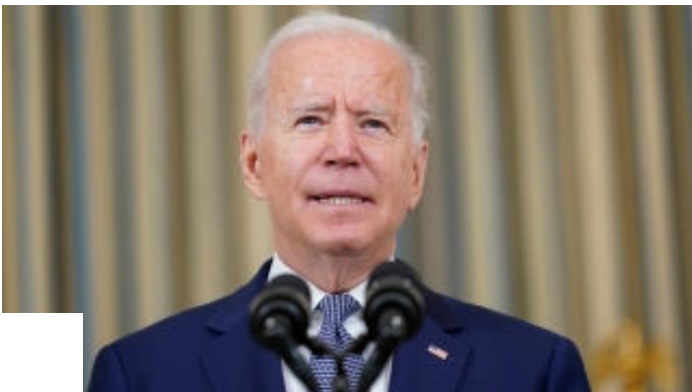
Biden calls for 'fairness' in economy after