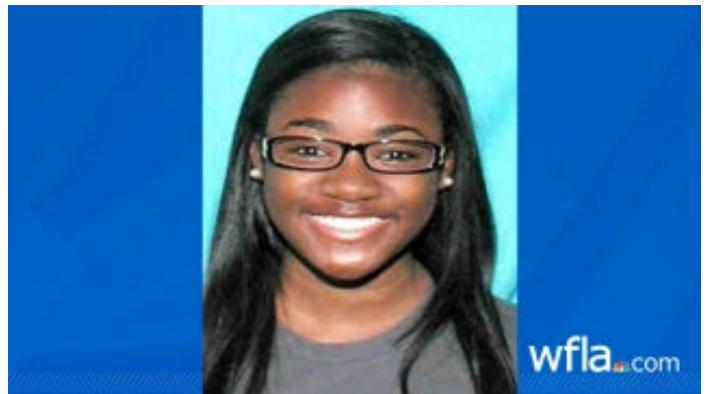
911 dispatcher wanted for hanging up on emergency callers