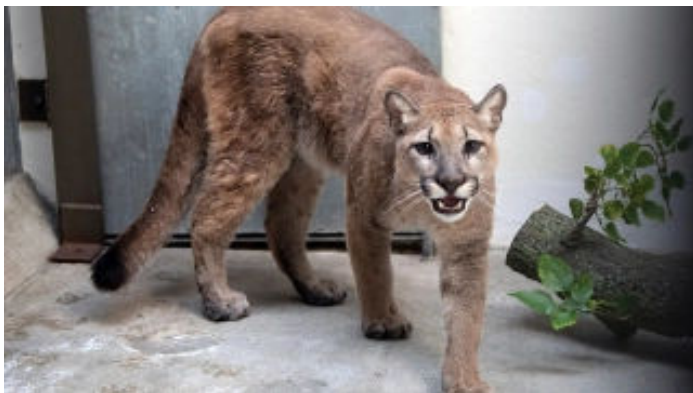
Cougar that was kept as illegal pet removed from NYC home