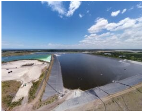
A retention pond on top of a gyp stack at Piney Point.

After a leak in a gyp stack was discovered on March 26, officials ordered the emergency evacuation of hundreds of nearby Manatee County homes and intentionally discharged 215 million gallons of water into Tampa Bay at Port Manatee to take pressure off a compromised stack, avoiding its collapse and a potentially more serious spill.