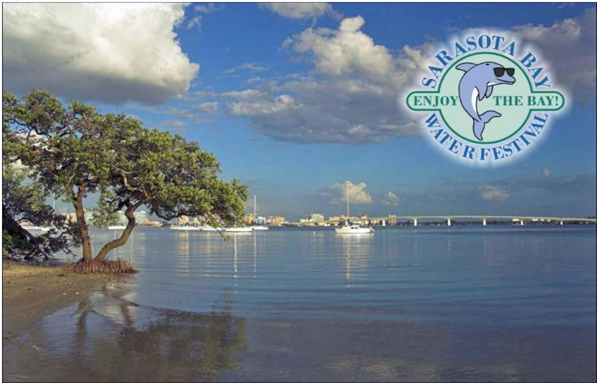
Scenic view of Sarasota Bay from Ken Thompson Park.