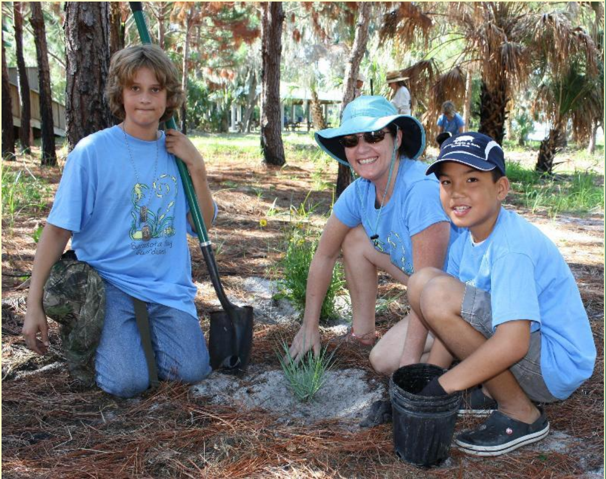
Bay Guardian volunteers at Emerson Point Preserve in Manatee County.