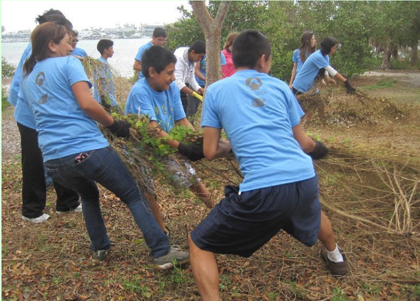
Volunteers at Quick Point Preserve

The plants for the project at Emerson Point Preserve are being donated by the Elizabeth Eaton Fund through the Manatee Garden Club and the materials for the portable monofilament containers are being provided by the West Coast Inland Navigational District.