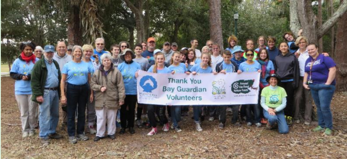
Bay Guardian volunteers following the completion of a project at Arlington Park.

A group of 53 Bay Guardian volunteers removed more than 1,200 pounds of air potato vines and seeds at Arlington Park on January 25. Removing the invasive plant supports the vitality of native vegetation. Another 61 Bay Guardian volunteers planted nearly 6,000 Florida-native plants near Jiggs Landing in Manatee County on February 8.