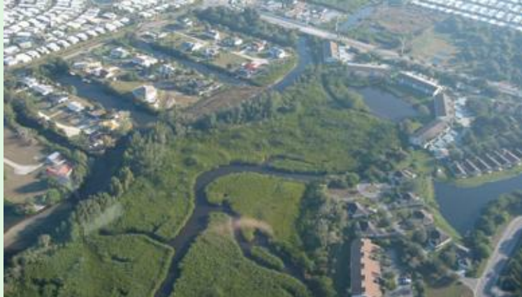
Curry Creek aerial

include Oscar Sherer / South Creek Phase II, Quick Point and Cattfish Creek. SBEP also received funding support from SWFWMD for habitat restoration at FISH Preserve located at the Cortez Fishing Village in Manatee County. SBEP also plans to strengthen the artificial reefs located in Manatee County this summer. The Sarasota Sportsman's Association has supported the effort over the years with donations exceeding $20,000.