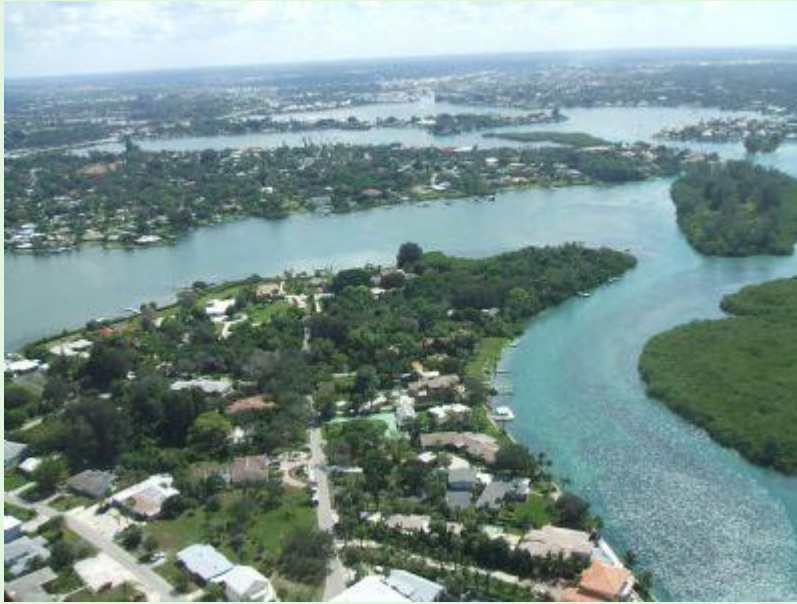
Photo of Lyons Bay

The U.S. EPA recently accepted the Florida DEP rules governing water quality for Sarasota Bay and other estuaries along the South and Southwest Coast. The rest of Florida's waterways will be governed by federal rules enforced by the EPA.