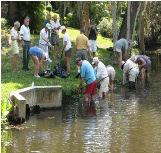
Volunteers at Pelican Cove

Applications for SBEP Bay Partner Grants are due no later than March 1. The grants promote local environmental education, awareness, community involvement, and Bay-friendly stewardship. SBEP has awarded more than $213,000 in Bay Partner Grants since 2003. All of the completed projects focus on Bay Restoration, Bay Education or Bay-Friendly Landscaping.