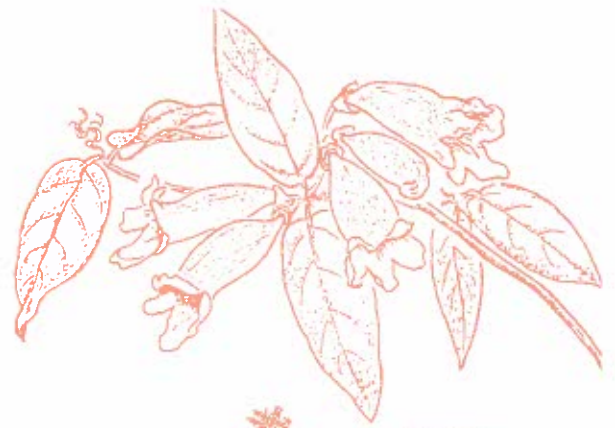
Crossvine by Roy Lance